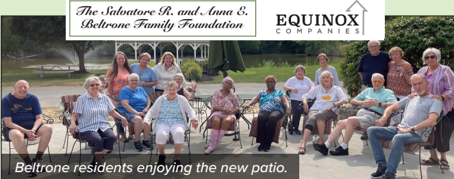
The Salvatore R. and Anna E. Beltrone Family Foundation

Heartfelt gratitude to Equinox Companies and the Salvatore and Anna Beltrone Family Foundation for their generous support towards the replacement of our south end outdoor patio. Our seniors now have a beautiful, safe, and welcoming space to enjoy fresh air, and socialize.