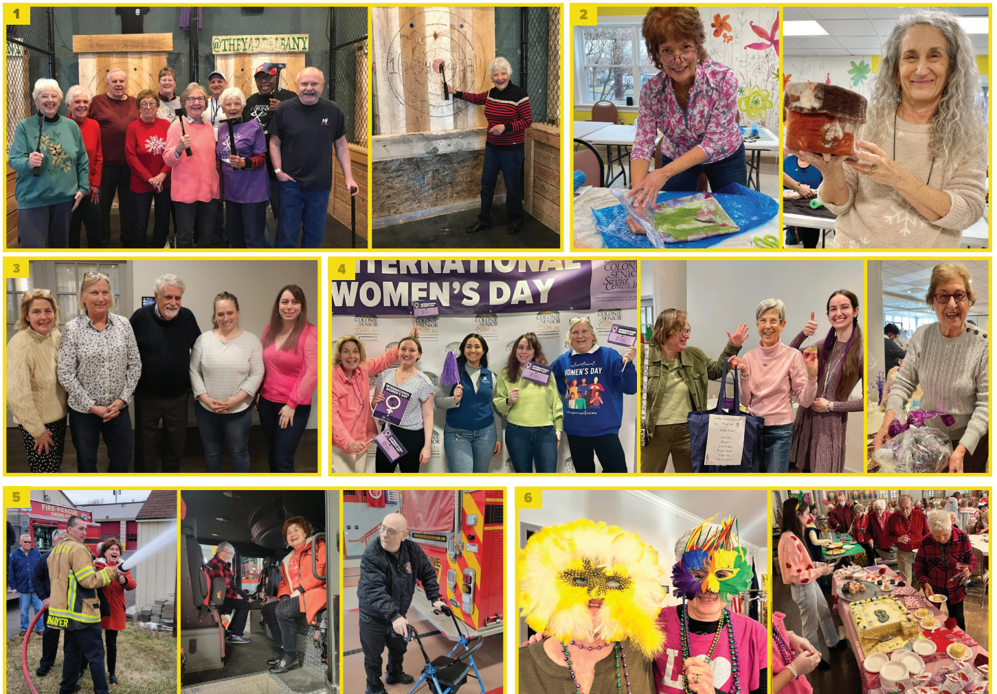
1 Axe Throwing