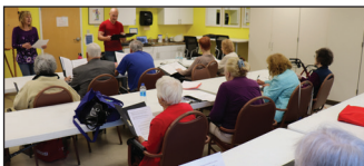
Forever Young Singers is sponsored by: