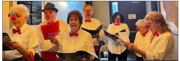
Forever Young Singers performing at Cohoes Music Hall Visitor Center on Sunday, December 4, 2022.

Not rain, nor sleet, nor snow can dampen the spirit of the Forever Young Singers! The group spread joy this holiday season with performances across the Capital Region. Want to join the fun? Singing is good for you: Improves your physical and mental health, forms new relationships, develops a sense of community. Make a New Year's resolution to be more musical. New members are always welcome. Simply come to a practice on a Thursday, 1 p.m. at The Beltrone Living Center, 6 Winners Circle, Colonie, and don't forget to bring your fun-loving spirit!