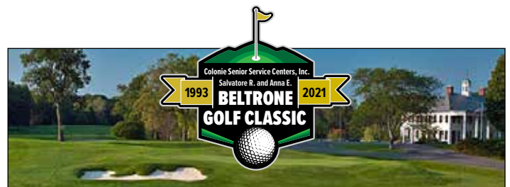
Schuyler Meadows Club

To make a reservation, call 518-459-2857 ext. 302