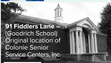
91 Fiddlers Lane – (Goodrich School) Original location of Colonie Senior Service Centers, Inc.