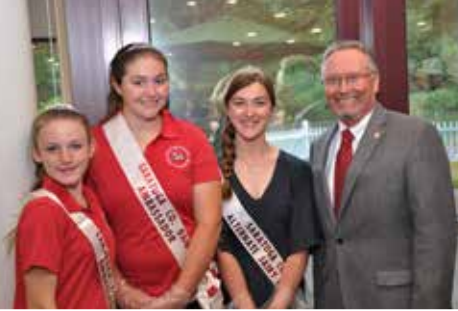
(L-R) Saratoga County Dairy Princess and her court